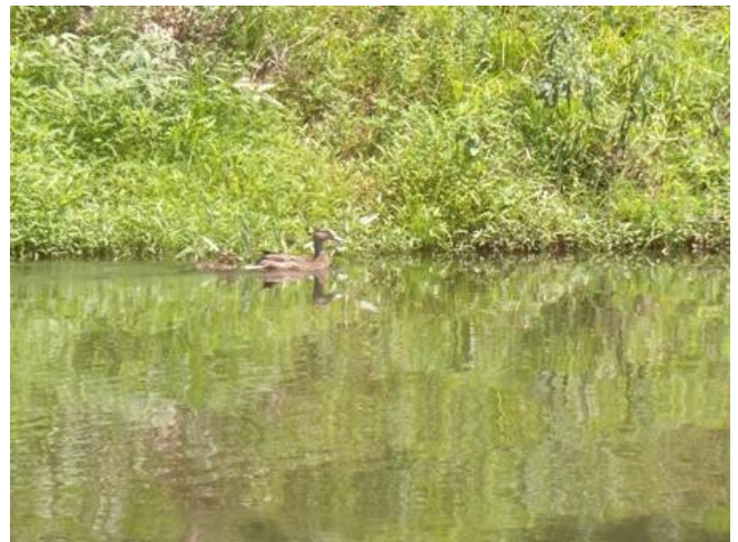
Residents of Opossum Lake take a swim!