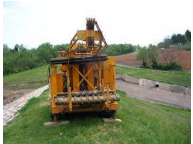
Drilling rig on dam breast

A piezometer is basically a well, established to gather sub-surface water level measurements. The piezometer is constructed of multiple sections of pvc pipe joined together and used as the well's "casing." (see drawing on Pg. 2) A seal made from bentonite clay is constructed around the well, just below the ground level. A protective steel casing is seen protruding from the ground, which houses the pvc piping within the larger steel casing. Certain sections of screened pvc piping are used at determined depths of known pockets of water or saturated soil (known as static water levels). This screened pipe is surrounded in the bore hole by sand. Static water easily filters through the sand and the screened pipe, resting within the piezometer. This allows static water level readings to be collected from each piezometer by simply removing the locked well cap and using a water level meter. This meter operates by lowering an electronic water sensor down until an audible beep is heard, which indicates top of the water in the piezometer. The depth is then marked and recorded to the nearest 0.01 foot. This data is